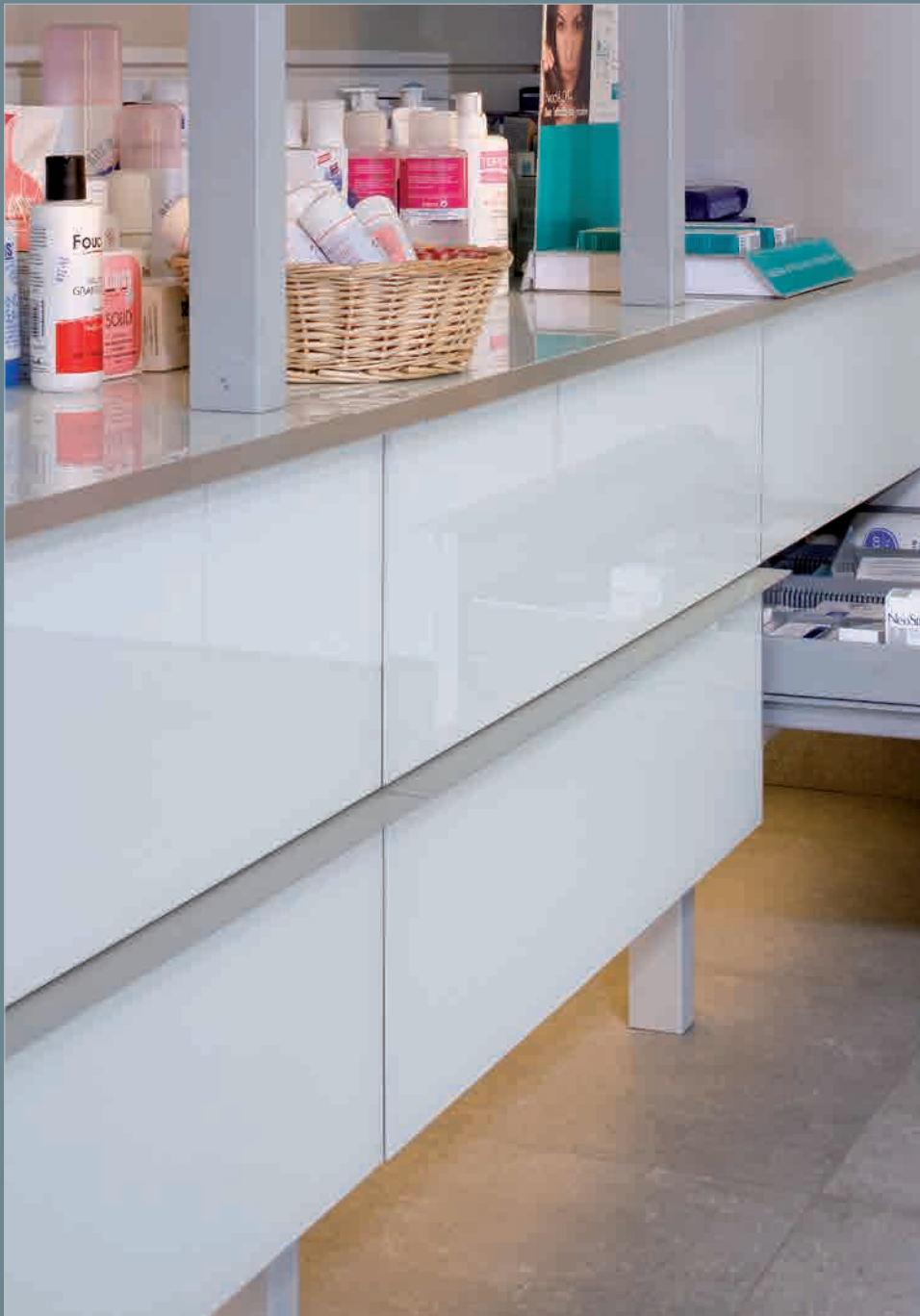
PHARMACY Drawers using painted Lacobel AB glass.