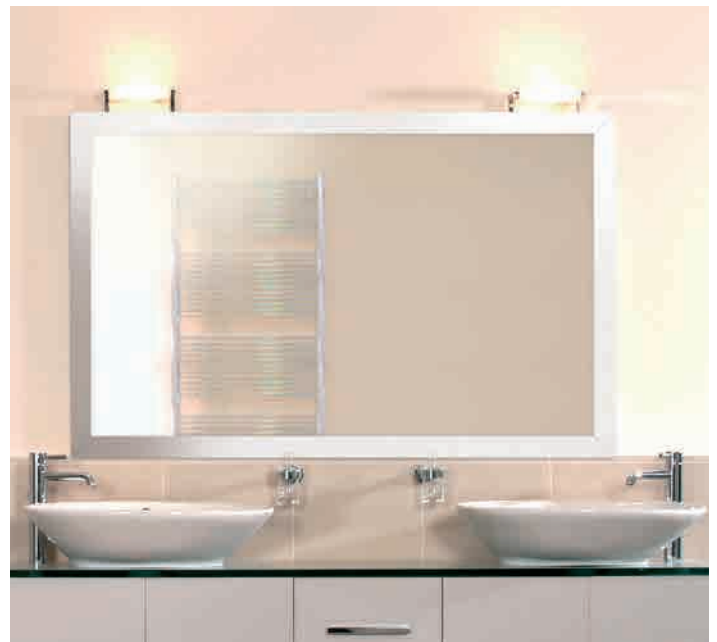
MIROX AB mirrors