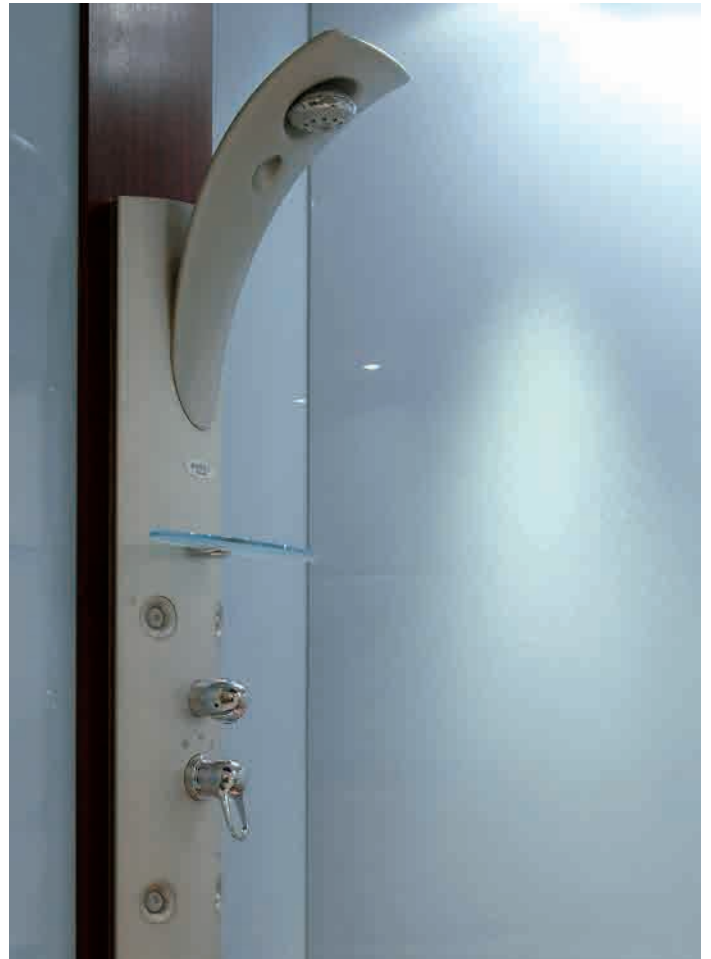
Lacobel AB used as wall covering in a shower.

Wall covering, partitions, double glazing and more: AGC Glass Europe's range of glass with a bactericidal effect is a comprehensive interior design solution.