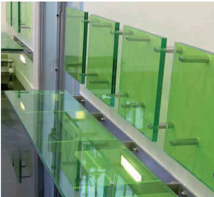
PLANIBEL AB Tinted, laminated PLANIBEL AB used on waiting room benches