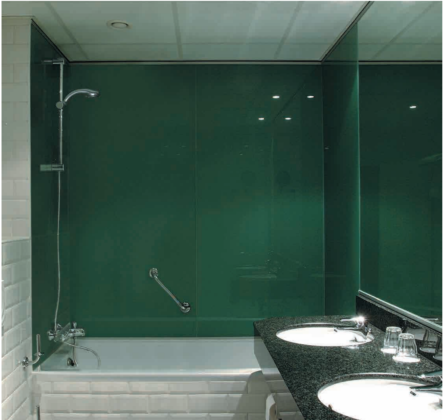
Lacobel AntiBacterial Glass™ makes an ideal wall covering in places prone to bacterial development, such as bathrooms.